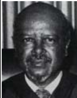
J. Franklyn Bourne Bar Association 30th Anniversary

"Membership (to paraphrase a current song) means never having to say you're sorry for not having joined."