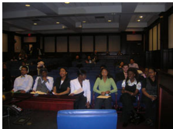
Participants patiently awaiting their opportunity to orate.