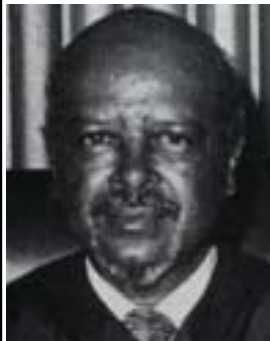
J. Franklyn Bourne Bar Association 30th Anniversary

ONE GENERATION PLANTS TREES THE OTHER GETS THE SHADE