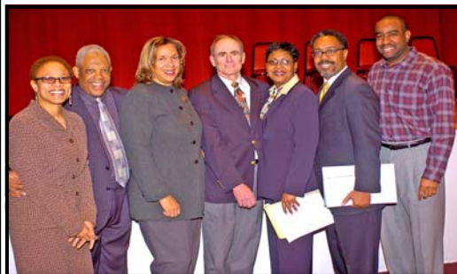
Organizers & judges of 2004 Oratory contest.

The winning contestant will receive a $1,000 college scholarship.