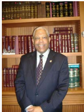
Judge Hassan El-Amin