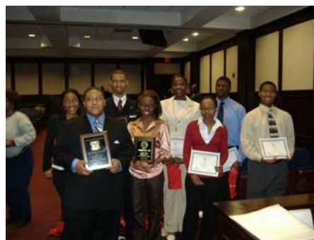
Pictured above are all the contestants whose tremendous efforts help make the JFB Oratorical Contest a huge success.