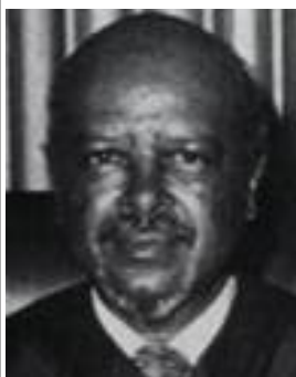
J. Franklyn Bourne Bar Association 30th Anniversary

I know I have heard it said somewhere before, "The true measure of any organization is its membership!" Whoever came up with that statement must have had JFB members in mind. Thanks to the Honorable Her-