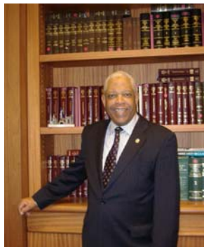
Judge Hassan El-Amin