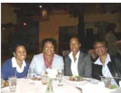
JFB Members enjoying the food at our meeting. This new format is recruiting new faces.