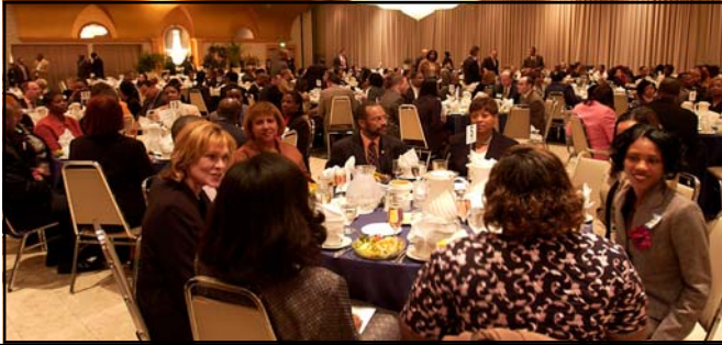
Upwards of 400 guests attended JFB's Scholarship Awards Banquet