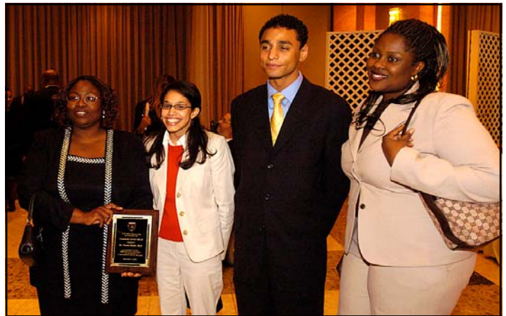
Scholarship Award recipients.