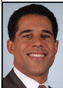
Del. Anthony G. Brown

Delegate Anthony G. Brown (D-Prince George's County) will be the keynote speaker at JFB's Annual Scholarship Banquet on Thursday, November 3rd at Martin's Crosswinds, Greenbelt, MD. Delegate Brown, a graduate of Harvard Law School, is Majority Whip, serves on the House Judiciary Committee, and recently returned from a tour of duty in Iraq.