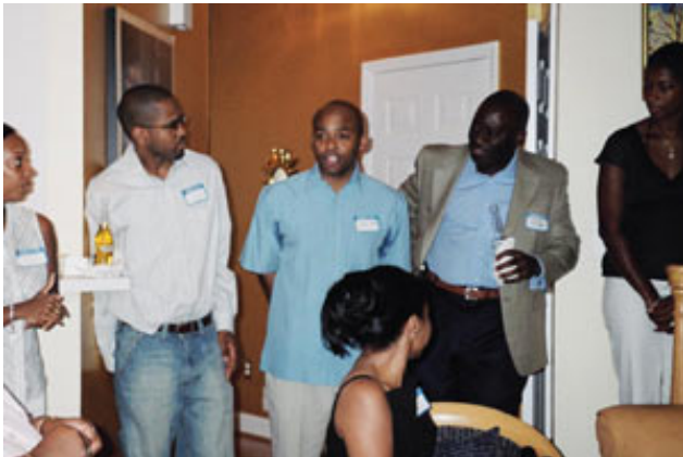
New Admittees introducing themselves at the JFB New Admittees Reception